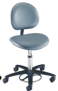
Model 21340B in Wedgewood