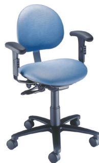
Model 21435BA in Azure Blue