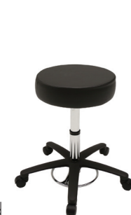
Model 21340 in Black

21340B - 18.5" (47 cm) seat 21340BV - 18.5" (47 cm) vacuum-formed seat 21340 - 16" (40.6 cm) seat; seamless upholstery not standard 21340V - 16" (40.6 cm) vacuum formed seat