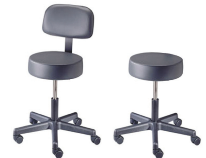
Model 22400B in Ash