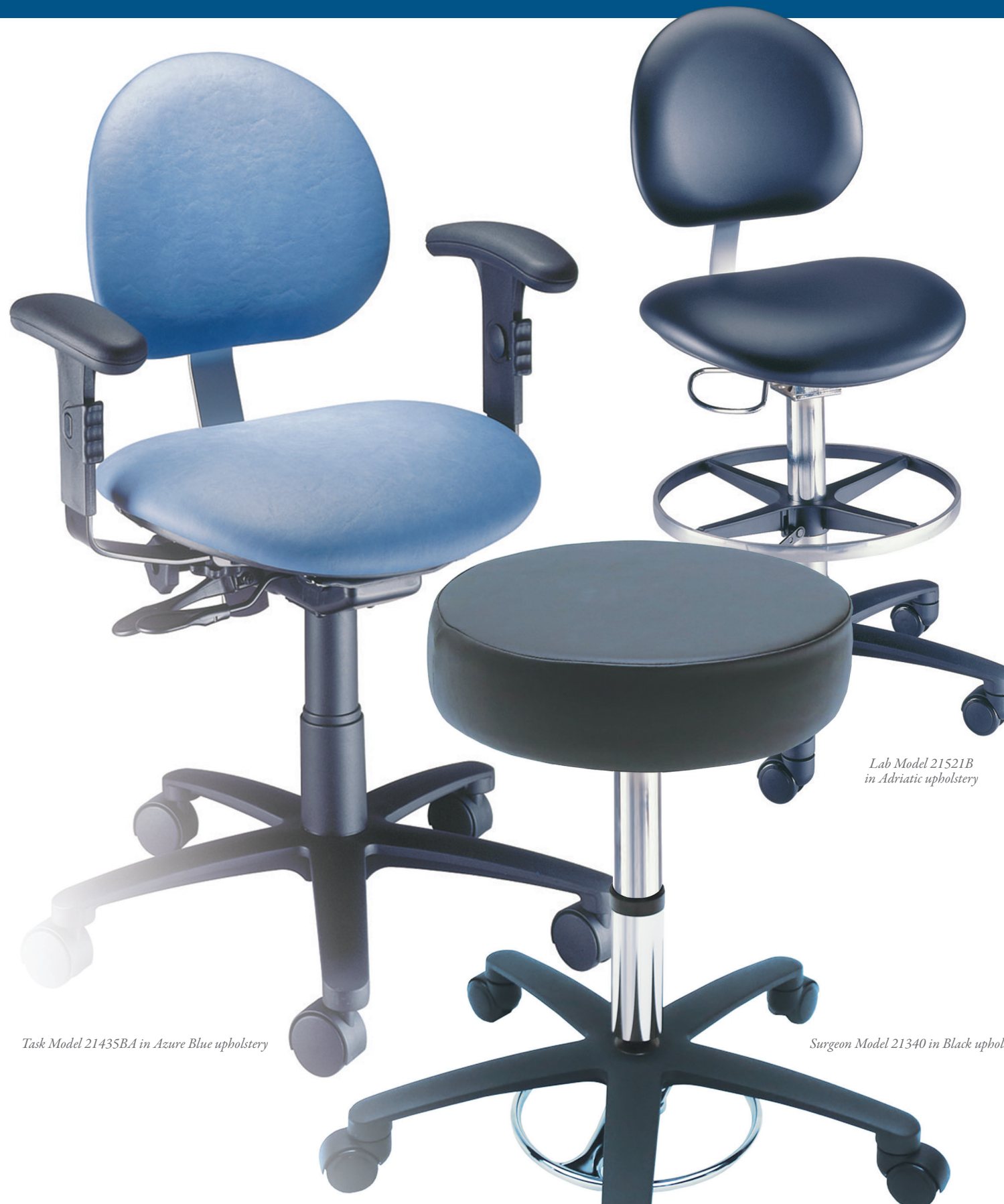
Lab Model 21521B in Adriatic upholstery